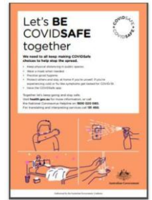
Living the new normal