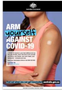
Arm yourself poster