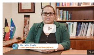
Why vaccines are important