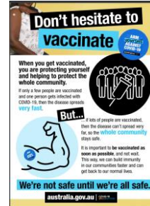
Don't hesitate to vaccinate