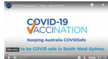
Stay Home during Sydney outbreak